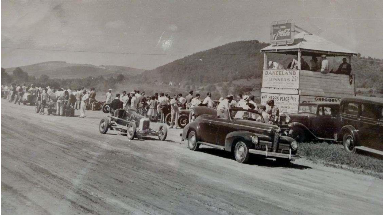
Kirkwood Speedway in 1940-1941